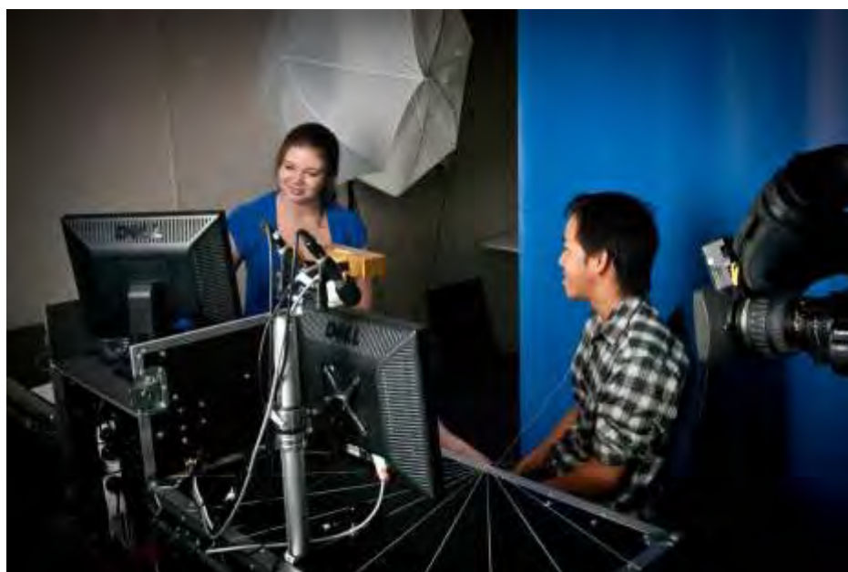
A recording session from Sydney University

The Big ASC project led directly to a successful grant application proposal for a Human Communications Science Virtual Laboratory, funded by the National eResearch Collaboration Tools and Resources (NeCTAR) Project, an Australian Government project conducted as part of the Super Science initiative and financed by the Education Investment Fund. The Alveo Virtual Laboratory (see http://alveo.edu.au/ ) houses 7 HCS databases (including AusTalk ) and 11 sets of tools for speech, language and video analysis.